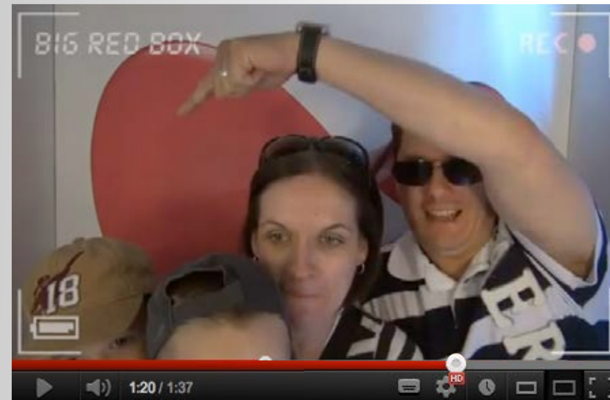
The Big Red Box What we've heard so far...

Across society, there are still some big differences in the way that people see all things digital. We found that it's not who you are, but how you use digital technology that matters most.